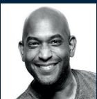
Kelsey Hightower Retired Distinguished Engineer, Author, Advisor, and Open Source Contributor

Many of the world's financial services and open source technology experts have presented in previous years. Each year the lineup is a who's who of financial services, fintech, and open source industry thought leaders delivering world-class content to attendees. 2025 will undoubtedly maintain that tradition in London.