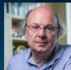
Bjarne Stroustrup, Morgan Stanley