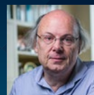
Bjarne Stroustrup, Morgan Stanley