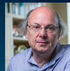
Bjarne Stroustrup, Morgan Stanley